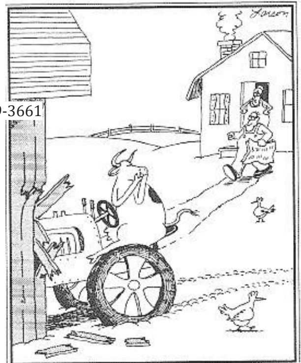
With a reverberating crash, Lulu's adventure on the tractor had come to an abrupt end.