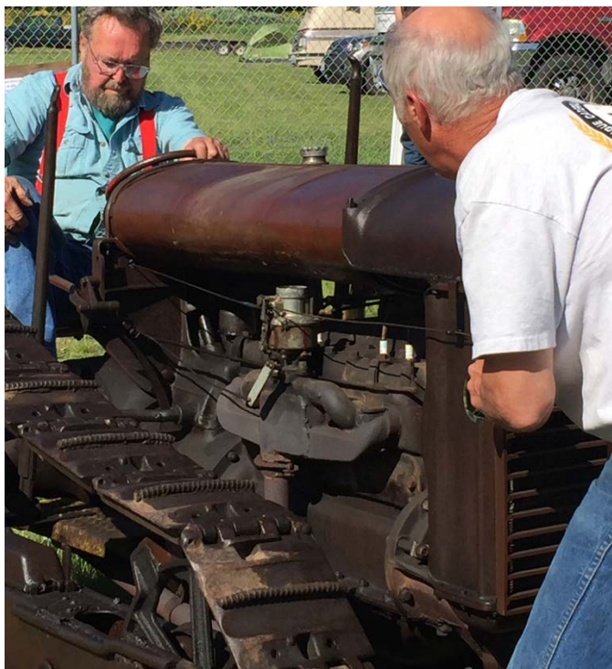
Matlock Old Timer's Fair offered sunshine and fun.